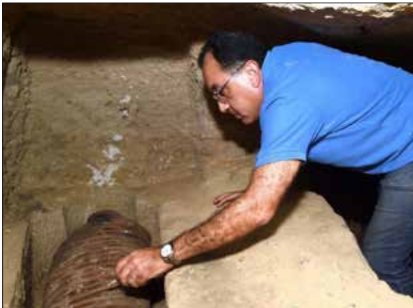
The Prime Minister inside the burial shaft

On 20 October, His Excellency the Prime Minister Dr. Mustafa Madbouly and Dr. Khaled El Enany, Minister of Tourism and Antiquities, accompanied by Dr. Mustafa Waziry, Secretary-General of the Supreme Council of Antiquities, visited the site of the discovery of new burial shafts that contain a huge number of colored coffins that were sealed for more than 2,500 years, in addition to colored and gilded wooden statues in Saqqara archeological site. This new discovery is from the excavation work of the Egyptian archaeological mission working in Saqqara. Details of this discovery will be announced next month at a press conference, after the completion of the archaeological documentation and photography works