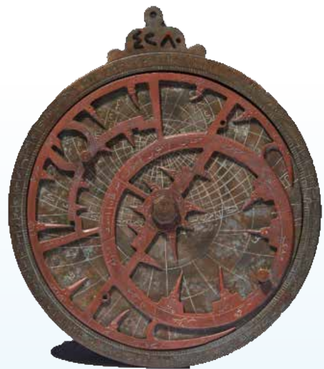
Astrolabe (astronomical instrument for determining directions) Used in the Islamic era - From Yusef Kamal's endowment