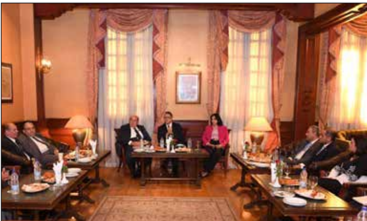
The meeting with the board of directors

On 14 October, the Minister visited the Automobile and Touring Club of Egypt, where he met with the elected board of directors to discuss a number of important issues related to the club, its activities. In addition to that they discussed the establishment of a project to make signboards for Egyptian streets around archaeological sites and museums. It was also agreed to set an agenda for events related to the activities of the club. The Automobile and Touring Club of Egypt is one of the oldest and most prominent automobile clubs in the world. It was established in 1924.