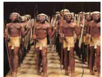
The Army of Ancient Egypt and The Eternal Struggle throughout History