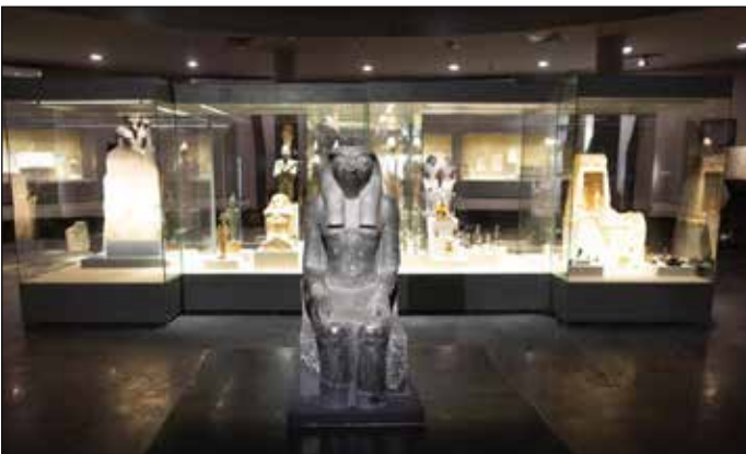
Kafr El-Sheikh Museum

This emphasizes the support Egypt gives to the tourism and antiquities sector. It also shows the importance given to showcasing Egypt's unparalleled history and its unique civilization through establishing and upgrading museums that display our rich heritage through different historical eras. The Minister said that, this was an exceptional day in the history of Egypt's tourism and antiquities sector, as 3 important museums were opened in the governorates of Sharm El Sheikh, Kafr El Sheikh and Cairo, at a cost of nearly one billion pounds.