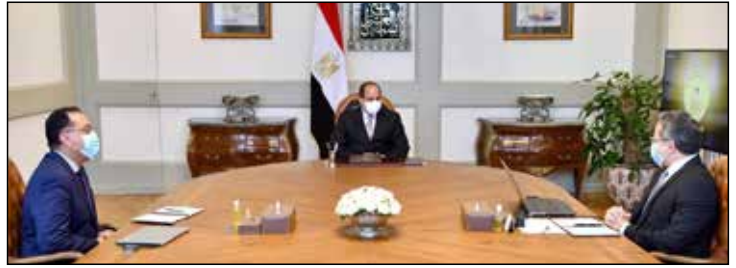
HE the President during the meeting with the Prime Minister and the Minister of Tourism

His Excellency President Abdel Fattah Al-Sisi directed offering all necessary protection to the labor force in the tourism sector in light of the government's ongoing support to the sector in response to the implications of the Corona virus crisis; in addition to the government's incentive programs directed to workers. This came during the meeting held by the President, on 7 October, with His Excellency the Prime Minister and Minister.