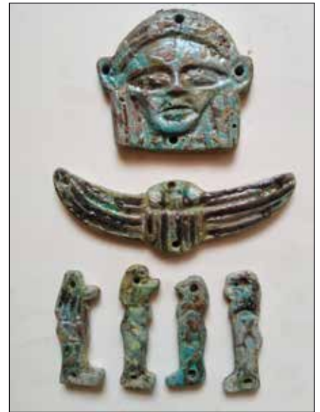
Some of the artifacts discovered

During the month of October, the Egyptian archaeological mission working in Al-Ghuraifah archeological site at Tuna Al-Gabal in Minya Governorate, discovered the tomb of the supervisor of the royal treasury, "Pa di Eset". The tomb consists of a burial shaft 10 meters deep, leading to a large room with niches carved into the rock closed with regular-shaped stone slabs. Two limestone statues were found, in addition to some of the most beautiful canopic vessels, and 400 Oshabti statuettes of blue and green faience. Four stone sarcophagi in human form were also found. The mission also uncovered a group of amulets and scarabs in the same area inside the coffin of "Djehuty Im Hotep", the chief priest of the god Djehuty from the 26th dynasty. The excavation work continues to uncover more treasures of Al-Ghuraifah.