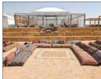
The opening of the first restaurant at the Giza Plateau