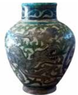
One of the retrieved artifacts

Within the framework of the Ministry's plan to raise the efficiency of those dealing with tourists in the archaeological and touristic sites, employees of the Citadel of Qaitbay in Alexandria received training within the "Tourism Ambassadors" Program. This program aims at qualifying employees and improving their communication skills in dealing with tourist. This program is sponsored by the Bank of Alexandria and implemented by Rhythm Company.