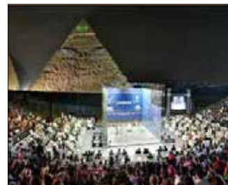
Egyptian International Squash Championship at the Pyramids