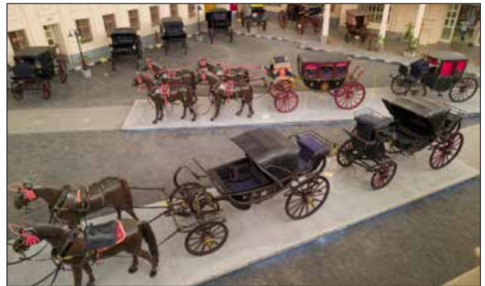
Royal Carriages Museum