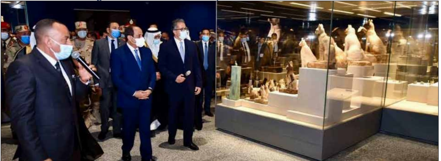
Visit of HE the president to Sharm El-Sheikh Museum

On 31 October, His Excellency the President Abdel Fattah El-Sisi, inaugurated the first museum of antiquities in Sharm El-Sheikh, the first museum of antiquities in Kafr El-Sheikh (via video conference), and the development project of the Royal Carriages Museum at Bulaq (via video conference) from the city of Sharm el-Sheikh. After that HE The President visited Sharm El-Sheikh museum.