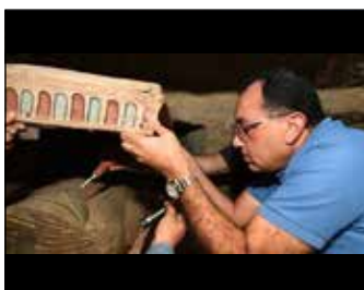
The Prime Minister inside a burial shaft in Saqqara