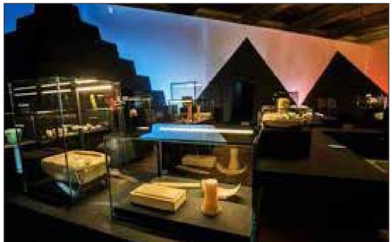
Part of the exhibition

A month after its official opening, the temporary antiquities exhibition "Kings of the Sun" in the Czech capital Prague received 20,000 visitors, as the exhibition witnesses a strong turnout of various age groups throughout the week. The average number of visitors exceeded 1500 visitors during weekends and public holidays, during. The Minister, the Czech Prime Minister and the Czech Minister of Culture had inaugurated this exhibition on 30 August 2020, in conjunction with the celebration of the 60th anniversary of the archaeological work of the Czech mission in Abu Sir.