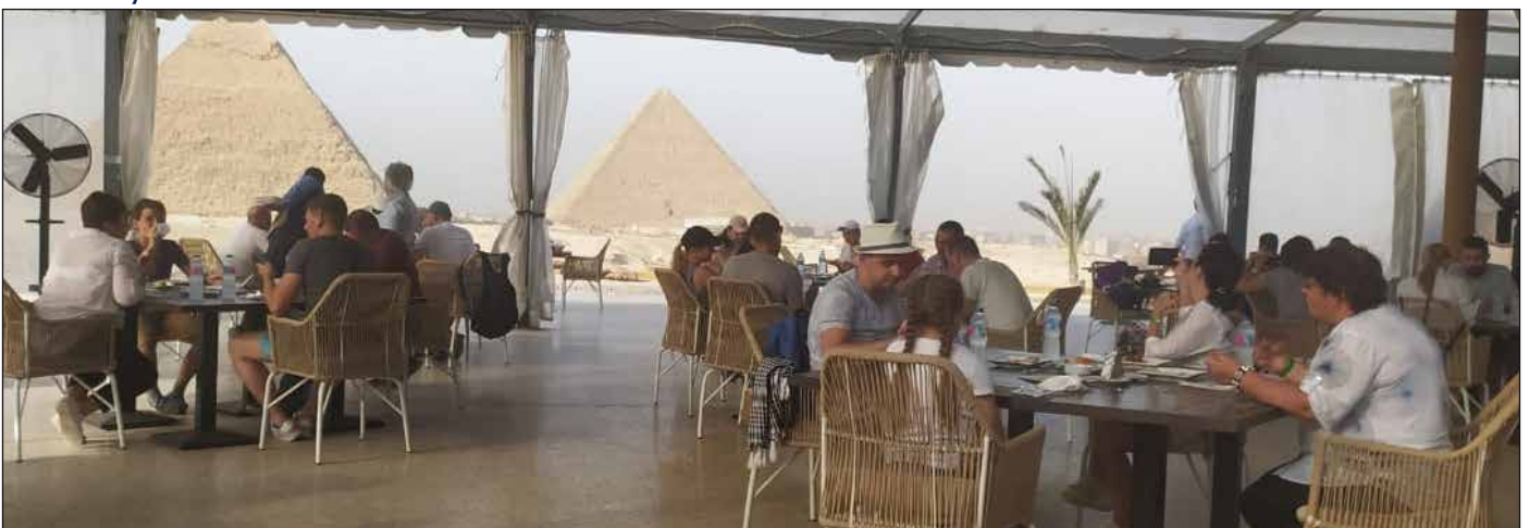
Tourist groups in the restaurant

As part of the cooperation between Orascom Pyramids for recreational projects and the Supreme Council of Antiquities, the Minister attended the opening of the Nine Pyramids Lounge, the first restaurant in the Giza plateau, and the operation of the first environmentally friendly electric bus, which will be later used in the route of the visit of the Giza Plateau. The Minister, was accompanied by the Chairman and CEO of the company, along with more than 50 ambassadors from Foreign, Arab and African countries in Cairo. After its opening, the restaurant, which overlooks 9 Pyramids, received tourist groups, including groups from Belarus and Ukraine, coming from Sharm El-Sheikh on "one-day" trips.