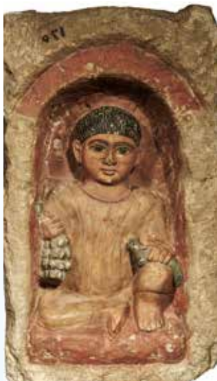
Tombstone of a child made of colored limestone - Coptic period