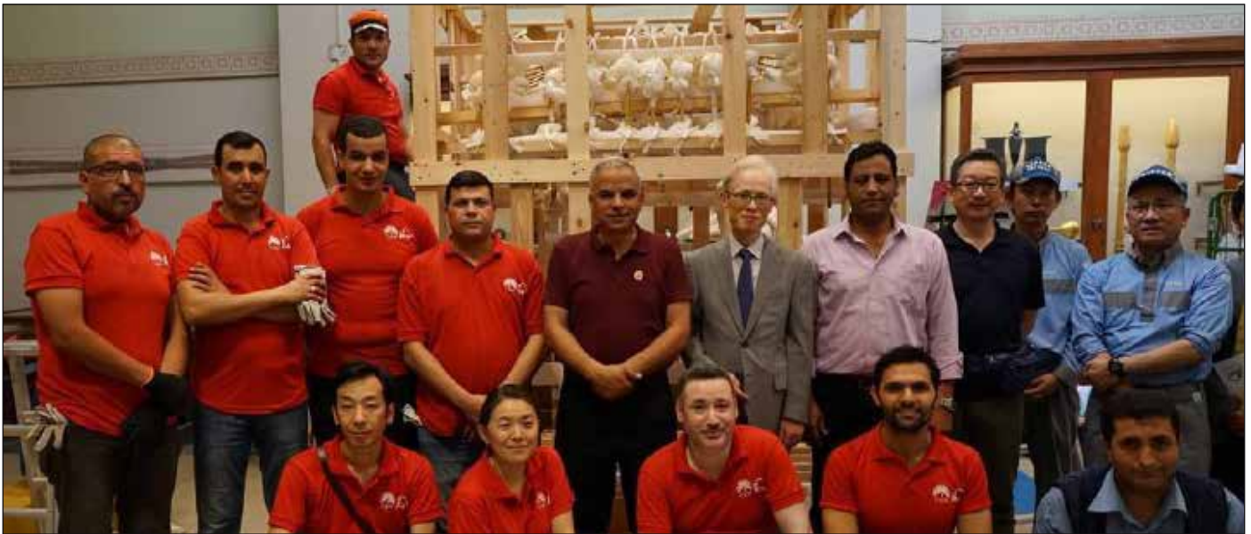
The Egyptian-Japanese team

In November, the Japanese International Cooperation Agency team (JICA), "The Egyptian-Japanese Joint Project for the Preservation and Restoration of Antiquities" in the Grand Egyptian Museum, won the Yomiuri International Cooperation Prize, in its 27 th edition, due to their efforts in restoring and preserving artifacts. This award is given under the auspices of the Yomiuri Newspaper, one of the leading Japanese newspapers, recognized by the Guinness Book of World Records as having the largest circulation in the world, with about 8 million copies per day. This prize is widely known in Japan, and awarded to Japanese people and groups making notable achievements in international cooperation.