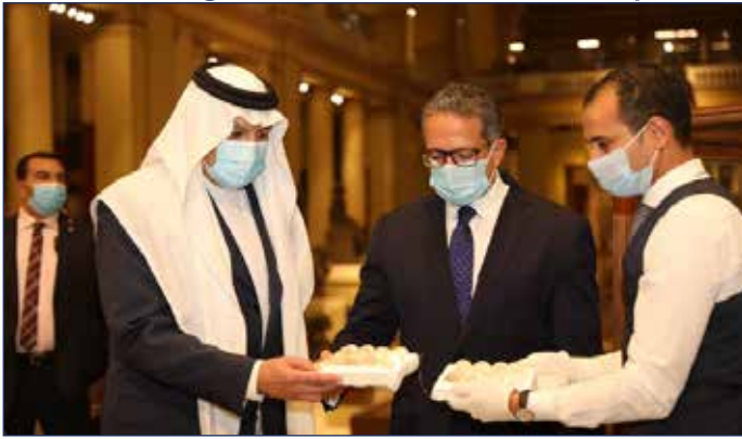
Handing over the coins to the ambassador of KSA