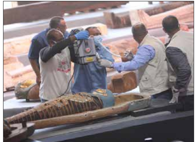
Doing an X-Ray for the mummy

During the announcement of the discovery, one of the coffins was opened and X- Ray was done on the mummy found inside. The uncovered coffins will be transferred to the Grand Egyptian Museum, the National Museum of Egyptian Civilization, the Egyptian Museum at Al- Tahrir, and