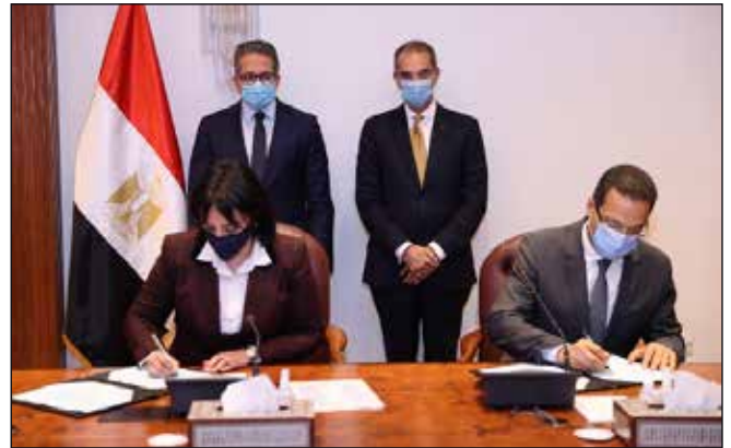
Signing of the protocol

On 12 November, the Minister and the Minister of Communications and Information Technology attended the signature of a cooperation agreement between the two ministries to develop the Information Technology infrastructure of the Ministry. The agreement was signed by the Vice Minister of Tourism and Antiquities for Tourism Affairs, and the Vice Minister of Communications and Information Technology for Infrastructure Affairs. The duration of this protocol is three years. It aims at achieving digital transformation to develop and improve tourism services. It also aims at documenting and digitalizing information about Egyptian antiquities. In addition to raising archaeological awareness and introducing the services provided by the Ministry, and its activities to the local and international community.