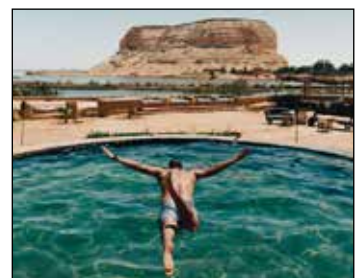
Siwa... An Oasis of Magic and Beauty p. 12