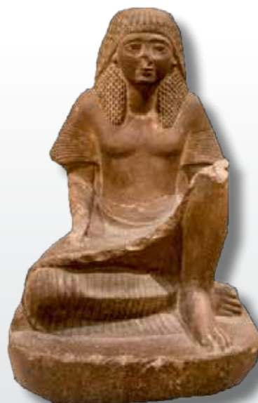
A seated statue for the supervisor of the Karnak Temple - al-Karnak - Nineteenth Dynasty - modern kingdom