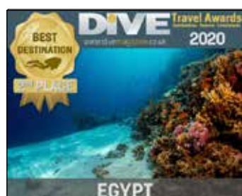
Egypt Wins Second Place as the Best Diving Destination p. 4