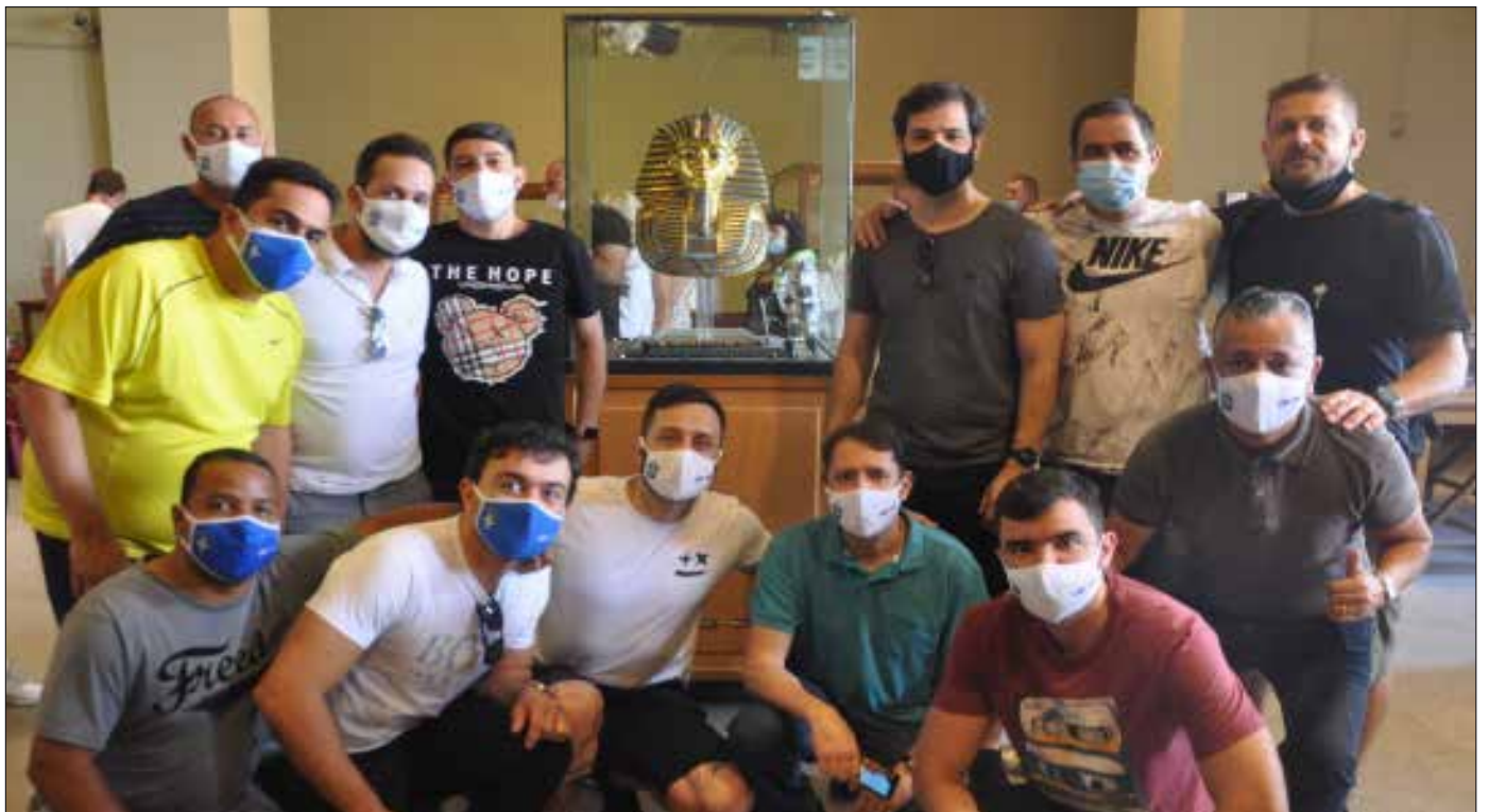
The Brazilian Olympic team inside the Egyptian Museum

On 18 November, the Brazilian U-23 Olympic team visited the pyramids of Giza, where they visited the Great Pyramid, the Sphinx, and the panorama area. The members of the Brazilian team also visited the Egyptian Museum at Al-Tahrir, where they had a tour around the museum galleries and they admired King Tutankhamun's collection.