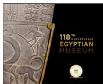
The Egyptian Museum celebrates its 118th anniversary p. 6