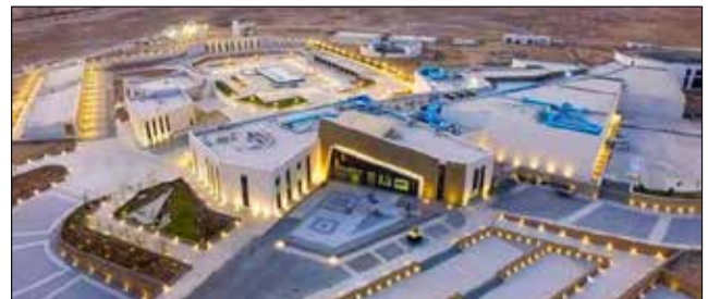
Sharm El-Sheikh Museum

Sharm El Sheikh Museum in South Sinai Governorate organized, during November, a lecture and a guided tour for a group of tourist guides to inform them about the museum and the artifacts displayed in it, to help them better explain the story of the museum and its display scenario to tourists in an interesting way. The philosophy of the display scenario of the galleries is to showcase the diversity and richness of the Egyptian civilization through different historical eras.