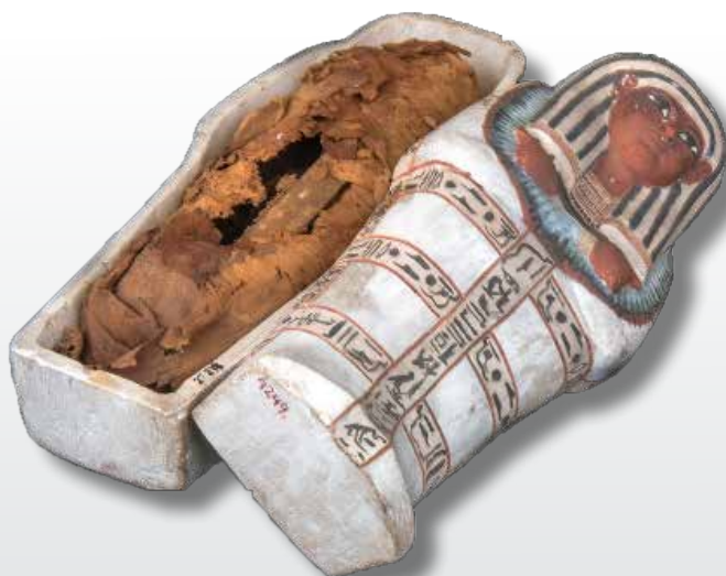
Canopic jar in the form of a coffin - Sengem Cemetery in Deir al-Madina - Nineteenth Dynasty - modern kingdom