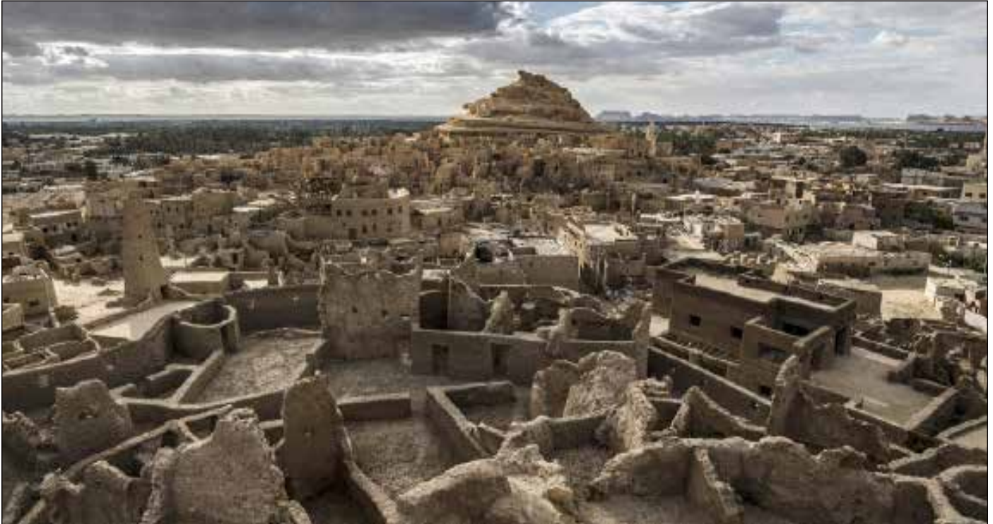
The village of Shali