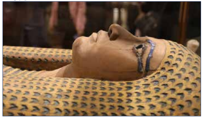
The "Cachettes: Hidden Treasures" exhibition

The Ministry celebrated the 118 th anniversary of the opening of the Egyptian Museum in Al- Tahrir .The celebration included the opening of two exhibitions: one permanent titled “Cachettes: Hidden Treasures”, showcasing 50 colored coffins, including two from the recent archaeological discovery in Saqqara and 48 coffins from the stores of the Egyptian Museum in Al- Tahrir, including 15 displayed for the first time. The other exhibition is a temporary one, displaying artifacts seized at Egyptian ports. The ambassadors of the United States of America, the Kingdom of Saudi Arabia, the People’s Republic of China, and the Attaché of the Indian Embassy attended the celebration. During the celebration, Ambassadors of the Saudi Arabia, China and India were handed over 100 ancient coins, belonging to their countries, which were seized at the Egyptian ports.