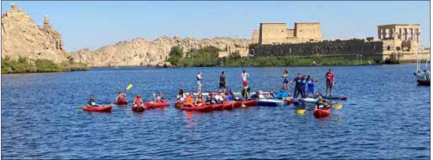
Part of the race

The city of Aswan hosted, from 21 to 23 November, the International Kayaking Championship, which was organized under the auspices of the Egyptian Tourism Promotion Board and in cooperation with the Egyptian Federation of Canoe & Kayak, Aswan's Water Sports Festival and the Governorate of Aswan. The sports event started near the Temple of Philae in Aswan. Egypt, especially Aswan, was chosen to hold this race because of its characteristic warm and sunny weather at this time of the year compared to Europe.