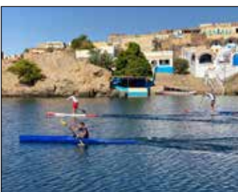
Aswan's International Kayaking Championship p. 3