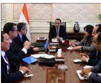
Ministry of Tourism and Antiquities faces Coronavirus P.2-3

On Thursday 5 March 2020, H.E. the Prime Minister, accompanied by the Minister of Tourism and Antiquities, inaugurated the restoration project of the step pyramid of Djoser, and the development of the surrounding area. Ambassadors of various countries, members of the Egyptian Parliament, the Chairman of the Egyptian Tourism Federation, and heads of tourism chambers, all attended the inauguration. The project, which lasted for nearly 14 years, and cost 104 million EGP, included external and internal restoration of the pyramid, the development of visiting routes leading to the pyramid, the internal corridors leading to the burial well, and the restoration of the sarcophagus. In addition, the walls were carefully restored, and a modern lighting system installed. Groups of tourists visited the Pyramid of Djoser, which is considered the oldest stone building in the world, after its inauguration.