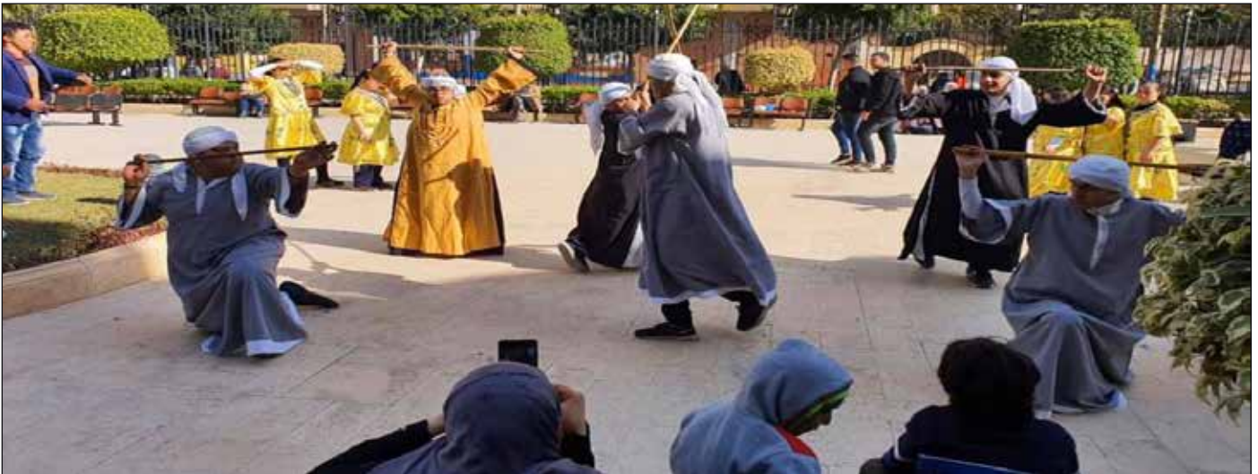
«Special needs» Art Show

On 15 March, the Royal Jewelry Museum in Alexandria organised an artistic celebration for children with special needs, on the occasion of celebrating the International Day of Down Syndrome. The celebration included theatrical performances of the «Special needs Arts» group, in addition to giving certificates of appreciation to the participating children. The ceremony concluded with a tour of the museum halls.