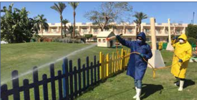
Sanitizing museums, archaeological sites, hotels and touristic establishments