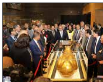
Celebrating the 40 th anniversary of rescuing the monuments of Nubia P.3