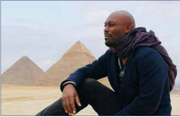
Jimmy Lewis at the Pyramids of Giza

Jimmy Jean-Louis, the Haitian-French actor, visited many archaeological sites in the governorates of Aswan, Luxor, and Cairo; he visited Tutankhamun's tomb, the temples of Karnak, Luxor, Hatshepsut and Philae and Elephantine Island and the Pyramids of Giza. During his visits he, invited the world to come to Egypt and enjoy its civilisation and its warm weather, through his social media accounts.