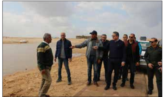
H.E. the Minister of Tourism and Antiquities while visiting the Pyramids archaeological site after the bad weather

After heavy rains and winds hit the country on the 12 th and 13 th of March, H.E. the Minister of Tourism and Antiquities inspected a number of archaeological sites in Cairo Governorate, on the 14 th of March, to check on their condition after the work of sweeping the rain water that accumulated in some of them. H.E. the Minister visited the Baron Empain Palace in Heliopolis and Al-Moez Street in the historical Cairo as well as the Pyramids archaeological site, where he encountered a group of tourists who was visiting the area.