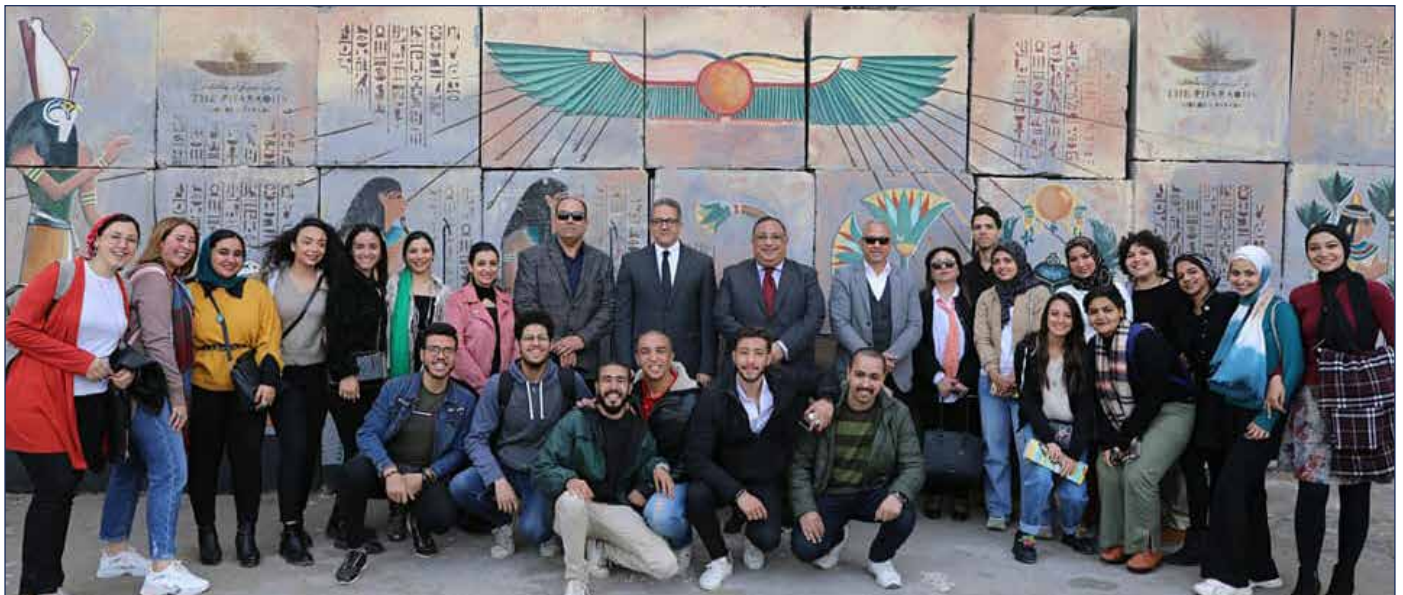
One of the murals designed by students of Helwan

A grand event is currently under preparation, where the Royal Mummies will be transferred from their current place in the Egyptian Museum in Tahrir to the National Museum of Egyptian Civilization in Al-Fustat. Students of the Faculties of Fine Arts, Applied Arts, and Art Education at Helwan University, under the supervision of their professors, are participating in this big event by designing artistic pharaonic wall murals along the way of the parade.