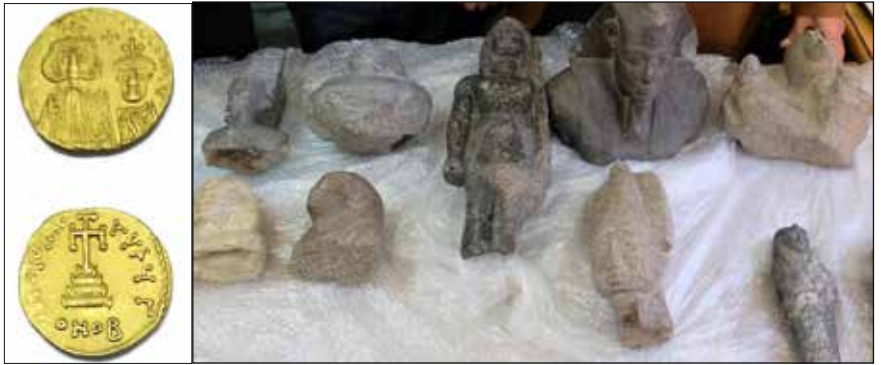
Gold coins and a group of heads of pharaoh statues seized in Cairo Airport

In its efforts to combat illicit trade of cultural properties, the Egyptian customs authorities, in cooperation with the Central Administration for Ports and Archaeological Units in the Egyptian Ports of the Ministry of Tourism and Antiquities, successfully retrieved 5 gold coins dating to the Byzantine era, at Cairo Airport. They also stopped the exportation of 16 parcels, which contained replicas of ancient artefacts, casting moulds, and suspected archaeological objects, including heads of pharaonic statues of individuals, kings, and deities made of granite, basalt, and limestone, and a number of artefacts dating back to different periods of ancient Egyptian history.