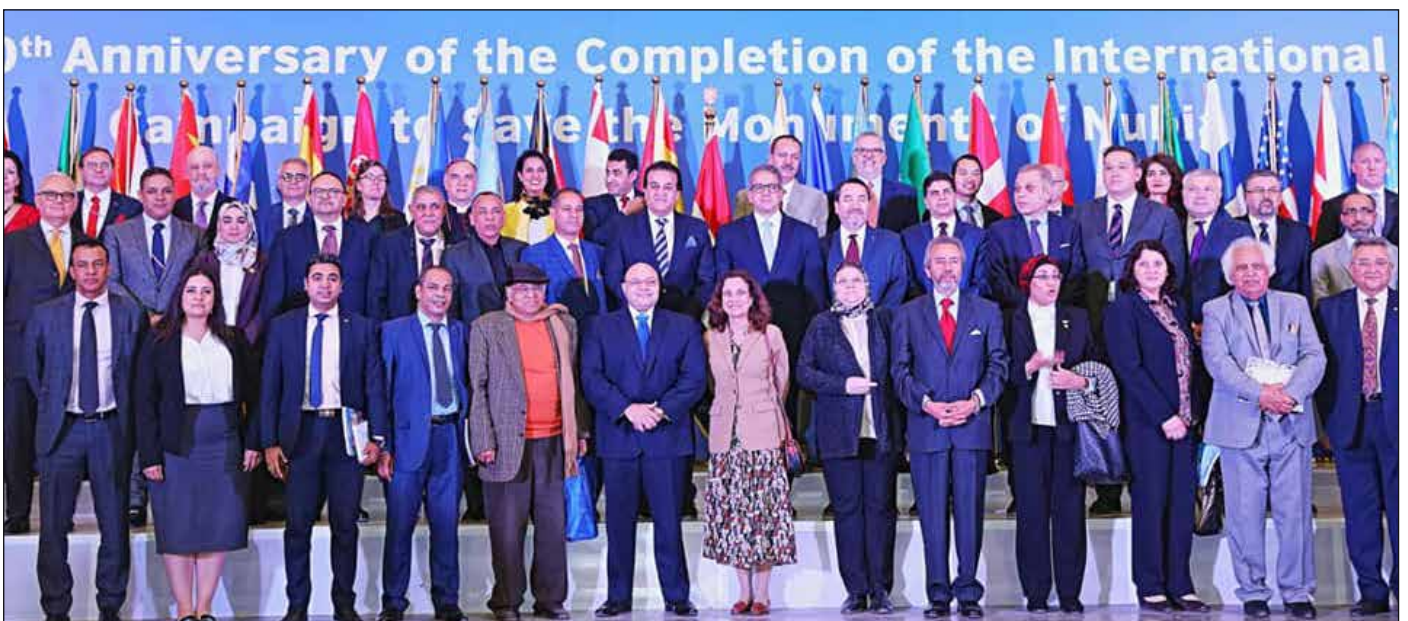
A group photo during the celebration

On 10 March, the Ministry of Tourism and Antiquities, in cooperation with the UNESCO Regional Office for Sciences in the Arab Countries in Cairo, celebrated the 40 th anniversary of the completion of the International Campaign to Save the Monuments of Nubia, at the National Museum of Egyptian Civilization in Fustat. The celebration was attended by 30 ambassadors, more than 20 members of the Egyptian Parliament, the director of the UNESCO Regional Office in Cairo, the Chairman of the Egyptian Tourism Federation, the Chairman of the Egyptian Hotel Association, heads of the Ministry, as well as some representatives of international organisations. The International Campaign to Rescue the Egyptian Antiquities in Nubia is considered the most important and largest archaeological rescue operation in the history of UNESCO. It started in 1960 and ended successfully on 10 March 1980, during which important monuments, the most famous being the temples of Abu Simbel and that of Philae, were rescued and transported.