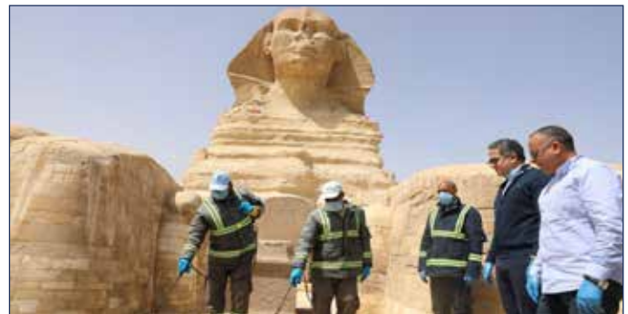
The Minister during the sanitization of the Giza Plateau

H.E. the Minister of Tourism and Antiquities held a meeting with the Chairman of the Tourism and Aviation Committee of the Parliament, the Chairman of the Egyptian Tourism Federation, the heads of tourism chambers, and the heads of sectors of the Ministry to discuss the implications of the Coronavirus on the tourism sector and to address the necessary and precautionary measures to deal with the crisis.