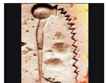
Prevention from Diseases by Ancient Egyptians P.8