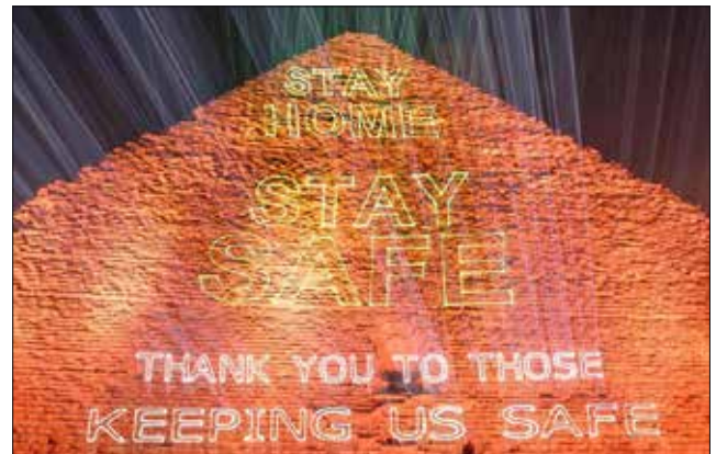
Lighting Khufu Pyramid with a message to the world

On Monday evening, 30 March, the Ministry of Tourism and Antiquities lit the pyramid of Khufu with a message addressed to the Egyptian people and to the people around the world to stay at home and stay safe. It also honoured and thanked those working on the frontline to protect everyone and fight the Coronavirus. The message read «Stay at home, Stay safe, Thank you to Those keeping us safe».