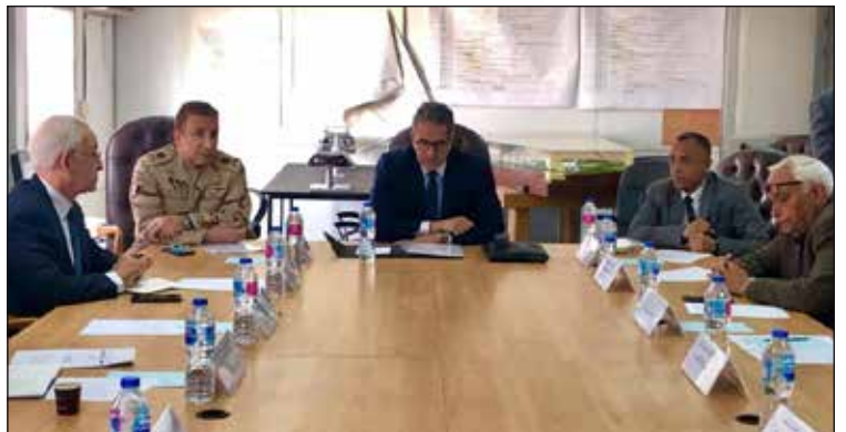
GEM's Board of directors meeting

H.E. the Minister of Tourism and Antiquities met with members of the Grand Egyptian Museum's board of directors, to discuss the latest developments in the project and the work plan during the upcoming period in light of the preventive measures taken against the Coronavirus. The Board of Directors approved a number of decisions: granting Egyptian visitors over the age of 60 a 50% discount on the price of the museum entry ticket, exempting Egyptian and foreign visitors with special needs from paying entrance ticket fees, issuing a special ticket valid for two successive days to visit the museum with 20% discount on the price of the two tickets. The Museum administration set specific dates and times to receive free trip visits from government schools.