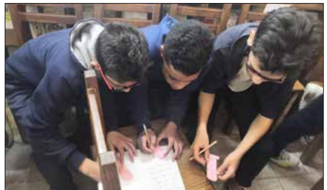
A group of students during the workshop of learning ancient Egyptian language

The Cultural Development and Community Communication Department of the Office of the Minister of Tourism and Antiquities organised an outreach activity titled «Ancient Egyptian Writing» in cooperation with the schools, affiliated with the National Institutes. The programme was conducted in public and school libraries, in order to invite students to visit libraries and urge them to acquire knowledge and do scientific research.