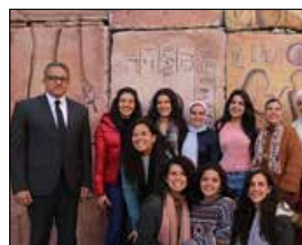
Murals on the route of the Royal Mummies parade P.4