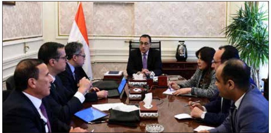
H.E. the Prime Minister chairs a meeting to discuss measures to face the Coronavirus

The Minister of Tourism and Antiquities chaired the Ministry's Crisis Management Committee to discuss the measures taken by various sectors of the Ministry to confront the implications of the Coronavirus on the sector.