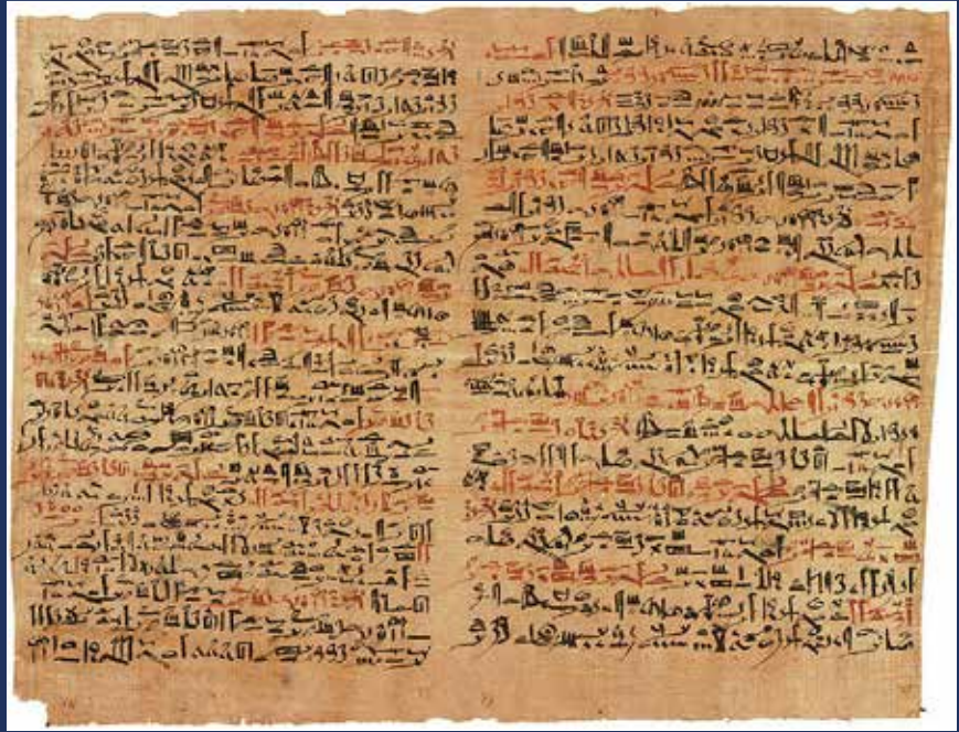
Part of «Edwin Smith» Medical Papyrus

The ancient Egyptians excelled in medical science. They succeeded in diagnosing many diseases and in finding treatments for some of them. Ancient Egyptians suffered from diseases that we still suffer from today. Infectious diseases were common, especially the plague and smallpox. There are important medical papyri that describe treatments of ailments, such as the Ebers papyrus, the Edwin Smith papyrus, the Hurst papyrus, the Cahon papyrus, and the London papyrus. The Ebers papyrus is the largest medical file ever found, containing descriptions and treatments for about 870 diseases, ranging from infections affecting the teeth, eyes, skin, and bones, female health, and heart disease. It also describes how to remove the poison of a snake bite.