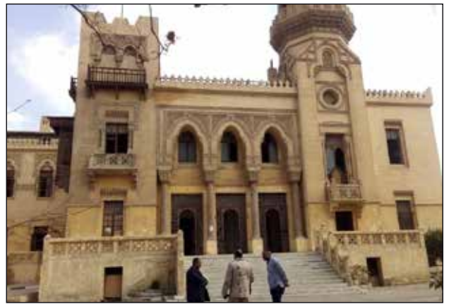
The Palace of Sultana Malak, the wife of Sultan Hussein Kamel

This palace, which faces the Baron Empain Palace in Heliopolis, was built by the Belgian engineer Edward Empain to be given as a gift to Sultan Kamil, who refused to take it as a gift and insisted on buying it. However, Sultan Kamil died before paying the price of the palace, so its property was transferred to the Heliopolis Housing and Development Company. It was agreed that the palace would be rented to the Sultana Malak, the second wife of Sultan Hussein.