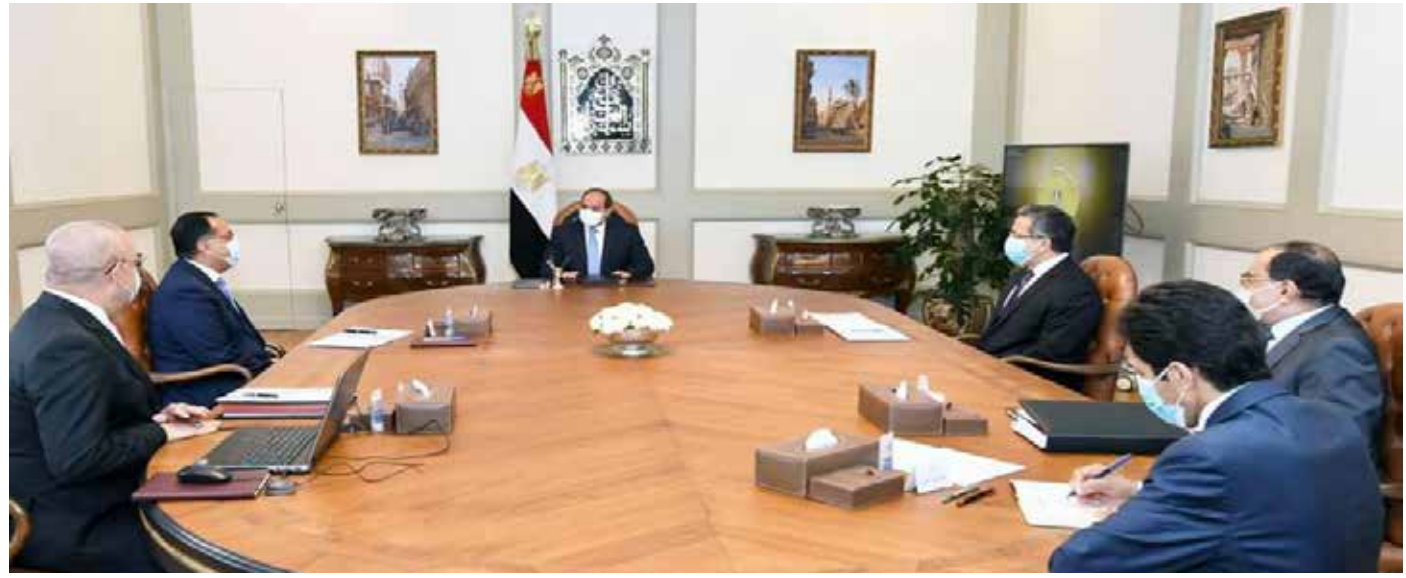
The meeting with H.E. The President

His Excellency the President met on May 29 with the Prime Minister, the Minister, and the Minister of Housing, Utilities and Urban Communities, to follow up a number of current and future projects in the field of tourism development. The meeting discussed efforts to boost inbound tourism to Egypt, the latest developments in the tourism and antiquities sector, the opening of museums, the Grand Egyptian Museum and the development project of the Sphinx Avenue in Luxor.