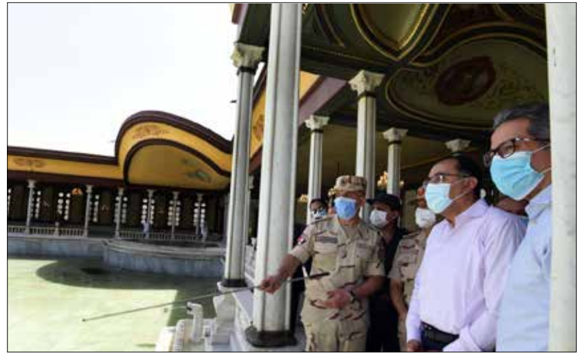
Part of the visit of the PM

On 31 May, the Prime Minister visited the restoration project of Mohammed Ali Palace in Shubra; to follow up on the progress of work there. He was accompanied by the Minister, the Governor of Qalyubia and officials of the Engineering Authority of the Armed The restoration work of the Forces. palace is in full swing, in preparation for its opening. The palace was built in 1808 AD, and the construction process continued until 1821. It consists of the Gabalaya kiosk building, and the Mosaic Palace building. Its construction was supervised by architect Zulfigar Katkhuda.