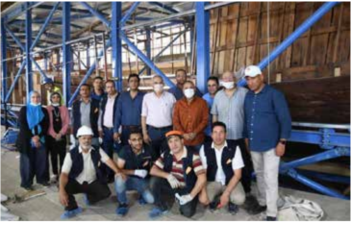
The team working on Khufu Solar Boat

On 5 May, the Secretary-General of the Supreme Council of Antiquities followed up on the progress of work in the process of the transportation of the first Khufu Solar Boat from its current display site at the Khufu Boat Museum in the Giza Plateau to its new display place at the Grand Egyptian Museum. The packaging and reinforcement work on the body of the boat is conducted in accordance with scientific international standards. The restoration team performed a comprehensive cleansing of the body of the boat before the reinforcement work taking very good care of the safety of all parts of the boat during the transfer, in addition to using of acid-free materials in the packaging process.