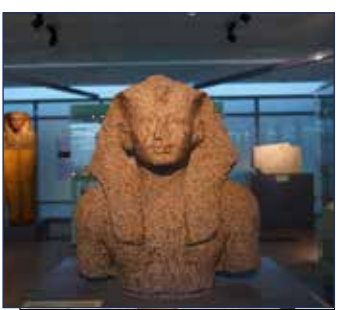
H.E. the President issues a Opening 2 Museums at Cairo decree forming GEM's board Airport on International Day of Museums p. 12