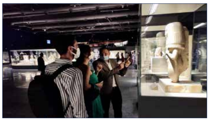
The bloggers in the museum

South Sinai governorate prepared a program for them from May 21<sup>st</sup> until May 27<sup>th</sup>. It included visiting Sharm El-Sheikh Museum, the old Market and the Sahaba Mosque, in addition to a sea cruise.