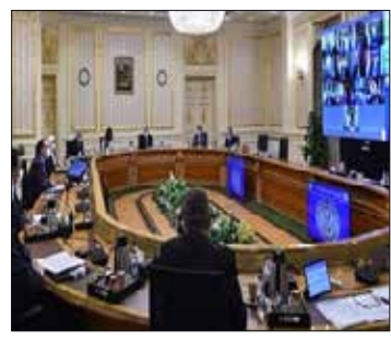
Summer Working Hours are Back for Malls, Cafes and Restaurants p. 2