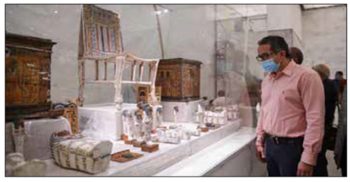
The Minister Inside one of the Halls of NMEC

The Minister of Tourism and Antiquities followed up on the latest developments in the central exhibition hall of the National Museum of Egyptian Civilization in Al-Fustat, in preparation for its forthcoming opening. After the visit, the Minister met the museum's archaeologists, restorers, and members of the Supreme Committee for the Museum's display scenario; where they discussed the ongoing preparations for the process of transporting the Royal Mummies from the Egyptian Museum in Al-Tahrir in a big royal procession and how they will be displayed in the hall designated for them in the museum.