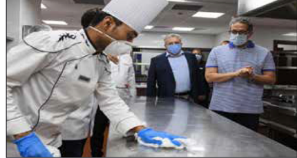
The Minister of Tourism and Antiquities Inspects a Hotel

In preparation for the resumption of inbound tourism to coastal touristic governorates from 1 July, 2020, the Minister of Tourism and Antiquities, accompanied a delegation of Egyptian and foreign media to visit a number of touristic governorates. The visits were organized by the Egyptian Tourism Promotion Board to the governorates of the Red Sea, South Sinai, Alexandria and Matrouh to inform the media about the precautionary measures implemented in all places that will receive tourists, including airports, hotels, clinics, hospitals, and diving centers, in addition to archaeological sites and museums.