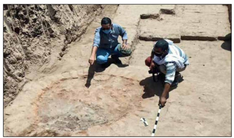
Part of the Discovered Ovens

The Egyptian archaeological mission discovered a number of round burning ovens of mud-brick with burning marks, which might have been used in the manufacturing of pottery or faience.