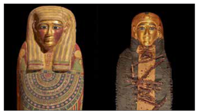
A Number of Pieces Received by the Airport Museum

Cairo International Airport Museum received 12 artifacts, from the storage areas of the Egyptian Museum in Al-Tahrir and the Suez National Museum, to be displayed in it. They included three mummies decorated with gilded cartoons and colorful drawings, canopic jars, a statue of the winged god Isis made of bronze, and statuettes from the Greco-Roman era.