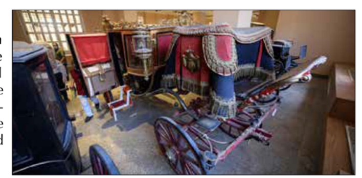
Part of the Royal Vehicles Museum

During a meeting of the Board of Directors of the Supreme Council of Antiquities, chaired by the Minister of Tourism and Antiquities, the Secretary General of the Supreme Council of Antiquities reviewed the plan of archeological openings during the coming period, which includes the museums of the new administrative capital, Sharm El-Sheikh, Kafr El-Sheikh, the Royal Vehicles of Bulaq, the National Museum of Egyptian Civilization in Fustat and Cairo Airport Museum.