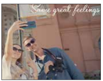
The Ministry launches the Film "A Tourist's Journey in Egypt" P 4