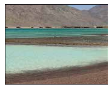
Journey to the Sands of Gold p. 8