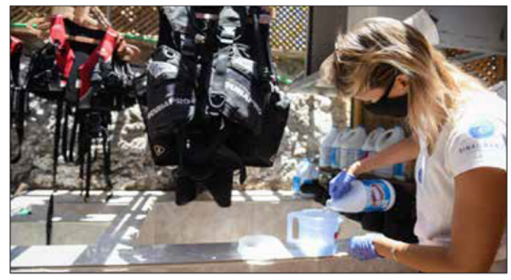
Disinfection of Diving Equipment in one of the Certified Centers