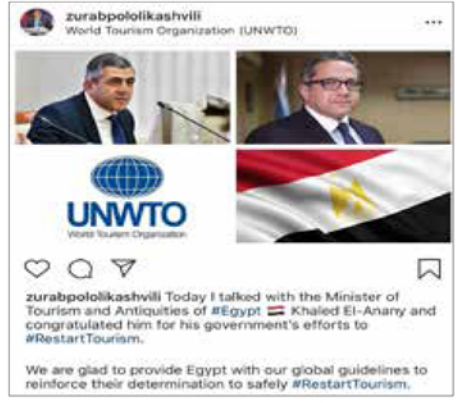
Tweet of the Secretary-General of the UNWTO

In another context, the Minister of Tourism and Antiquities met with the Director General of the Islamic World Organization for Education, Science and Culture "ISESCO", via video conference. An agreement to broadcast virtual tours launched by the Ministry during the past months on its official platforms on social media, on the ESICO Heritage Portal and the ISESCO Digital House was made.