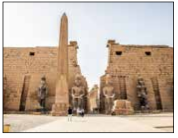
Decisions of the SCA to promote Cultural Tourism P. 6