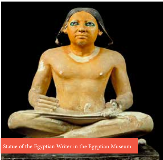
Statue of the Egyptian Writer in the Egyptian Museum