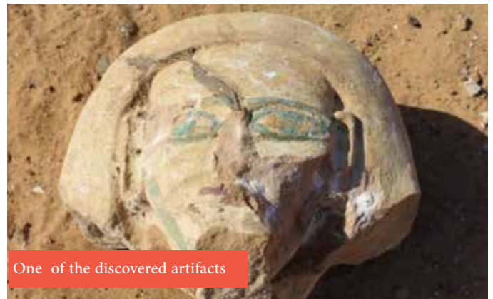
One of the discovered artifacts

The joint Egyptian-Italian archaeological mission working in the vicinity of the Mausoleum of the Agha Khan in west Aswan, succeeded in uncovering a Greco-Roman rock-cut tomb. This tomb consists of two parts, the first above ground and the second carved into the rock.