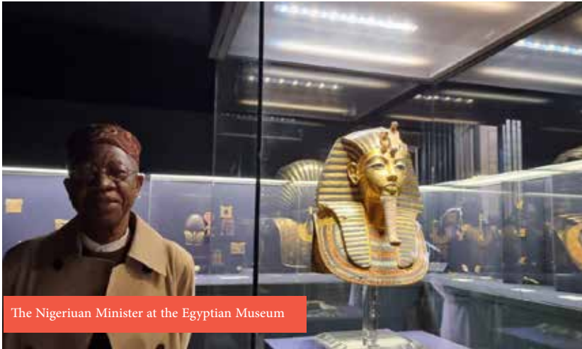
The Nigerian Minister at the Egyptian Museum

The Minister received the Minister of Information, Culture and Tourism in Nigeria on January 25, to discuss cooperation between the two countries in tourism and archaeology fields. The Nigerian Minister praised the Egyptian efforts in tourism promotion and the resumption of inbound tourism since July 2020. He expressed his wish to benefit from the Egyptian experience on managing museums,