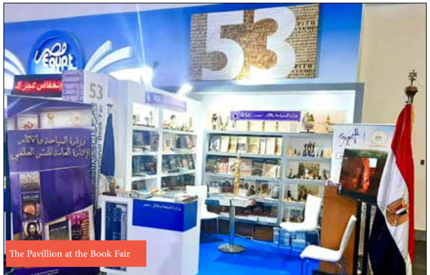
The Pavillion at the Book Fair

The Ministry, represented by the ETPB, and the General Administration of Scientific Publishing in the Supreme Council for Antiquities, in cooperation with Konuz Factory for archaeological replicas, participated with a pavilion in the 53 rd Cairo International Book Fair, held from January 26 to February 7. The board of directors of the Supreme Council of Antiquities approved granting a 50 % discount on all its publications.