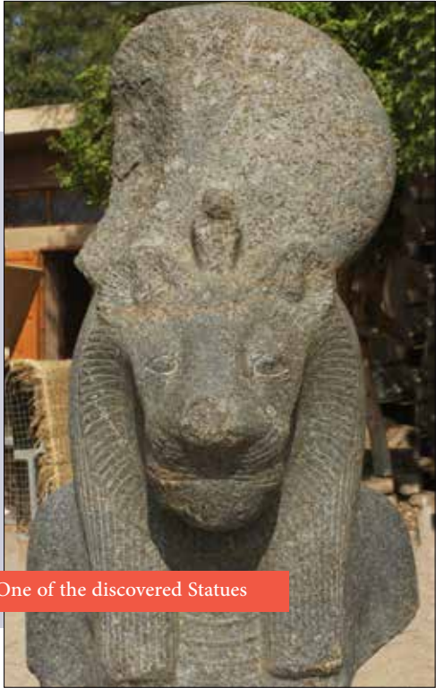
One of the discovered Statues