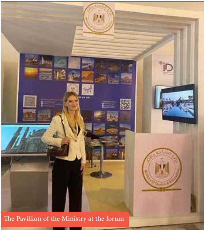
The Pavillion of the Ministry at the forum