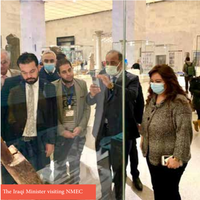
The Iraqi Minister visiting NMEC

The Minister received the Iraqi Minister of Culture, Tourism and Antiquities on January 29. Many aspects of cooperation were discussed, including carrying out a series of workshops, joint programs to exchange expertise in the field of archaeological restoration, documentation training, and building museums.