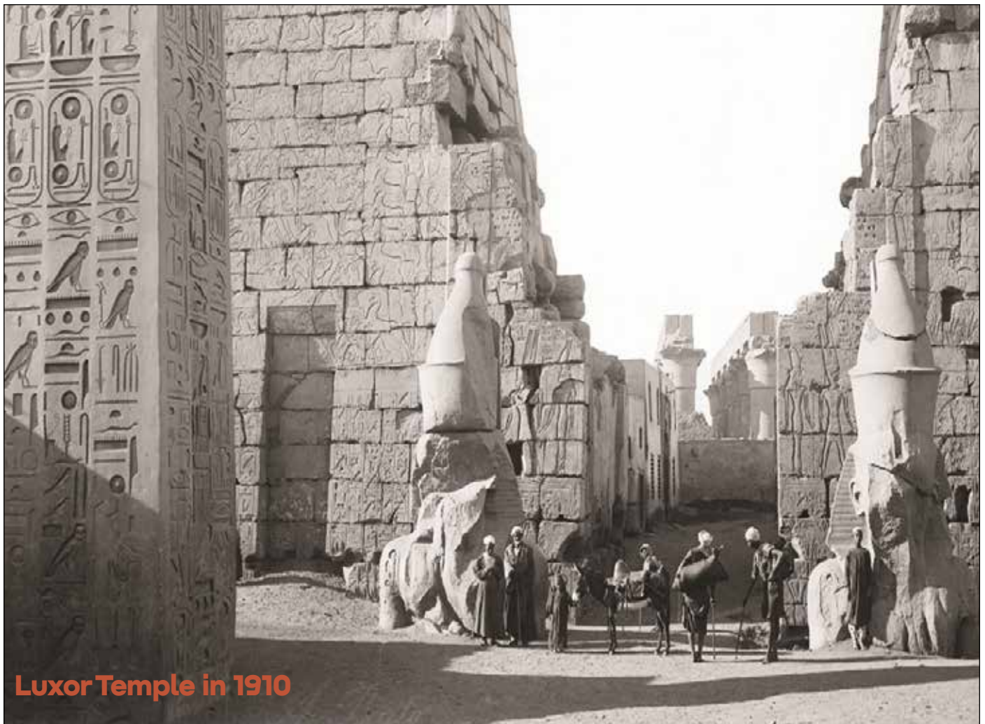
Luxor Temple in 1910