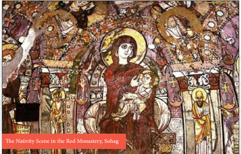
The Nativity Scene in the Red Monastery, Sohag

Celebrating Coptic Christmas is considered the most important and famous Coptic celebration. The Coptic Church celebrate the memory of the birth of Jesus Christ