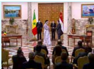
The President and his Senegalese Counterpart Witness the Signing of an MoU in Archeology

The directives of H.E. the President came to facilitate the procedures for obtaining licenses for hotel and tourist establishments. Therefore, it was necessary to prepare a draft law to coordinate between all relevant authorities responsible for issuance of such licenses through what is called the "single window procedures". This is without hindering the right of each authority to collect the fees stipulated in laws and resolutions. These new procedures aim to improve the business conditions in Egypt, enhance its competitiveness to attract investments, and keep pace with all developments that have occurred in the tourism industry during the past decades. The Parliament also approved a draft law for establishing the Tourism and Antiquities Support Fund which aims to support and finance activities that develop and revitalize tourism and promoting it globally, developing services and tourist sites, stimulating inbound tourism. It also aims at supporting the activities of the Supreme Council of Antiquities projects related to the restoration, preservation and maintenance of antiquities, the development of archaeological sites, and the preservation of the cultural heritage in accordance with the concept of sustainable tourism development.