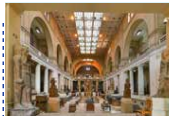
The Board of Directors of SCA Grants African Visitors the Same Entry Ticket Prices as Egyptians