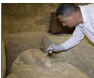
Archaeological Discoveries P.2