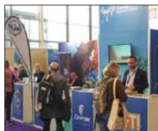
International Exhibitions P.3