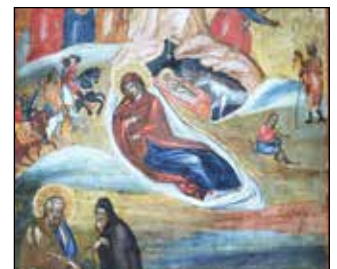
Birth of Jesus Christ Icon P.8