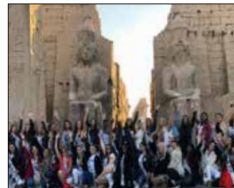
Miscellaneous News P.4-5